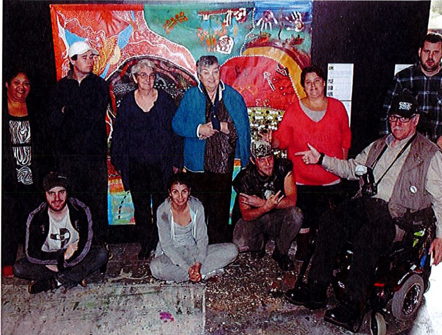
The Disability Art Group had a smash hit on their hands with a painting sold from the aboriginal art workshop.

THERE'S nothing daggy about these DAG's.